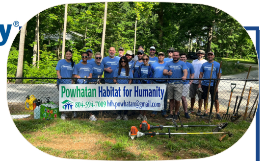
CarMax Cares Volunteers